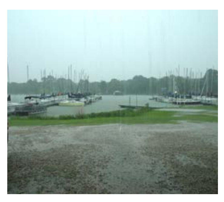
Still more rain falls on LWSC. Check your boats, drain standing water before the mosquitos find it.